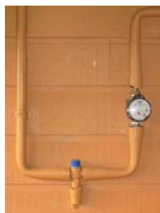
Tempering valve & 1 of 2 water meters for SHW tank

A cold-water tempering valve is fitted to the solar hot water outlet to prevent scalding hot water exiting taps in summer. It is set at 50°C. In summer (Feb-March), almost half of water exiting hot taps was mixed cold water (57 L of 124 L/day) whilst in winter (May-July) only 20% of water was mixed cold water (36 L of 178 L/day). Winter hot water use was higher than summer due to longer/fuller showers/baths. Hot water use is typical for Alice Springs (ASP averages around 150 L/house/day).