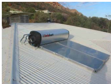
Monitored Solahart 302J unit

The monitored Solahart 302J unit and its installation are very typical for Alice Springs. 60% of houses have solar hot water and most are Solahart 302J systems (DIPE survey 2001).